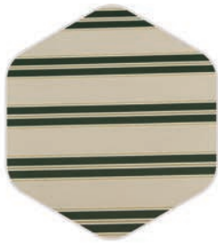
Black Forest Fancy