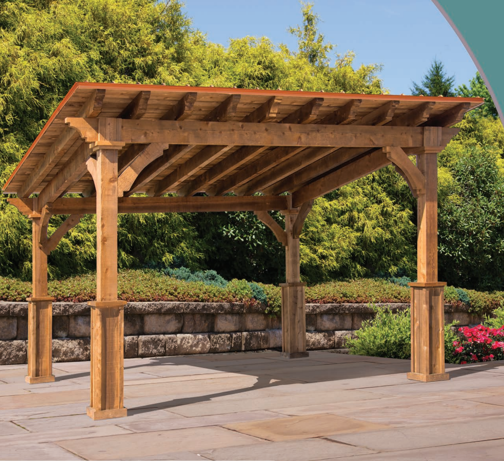
Shown in rough cut cedar with copper roof and maple stain