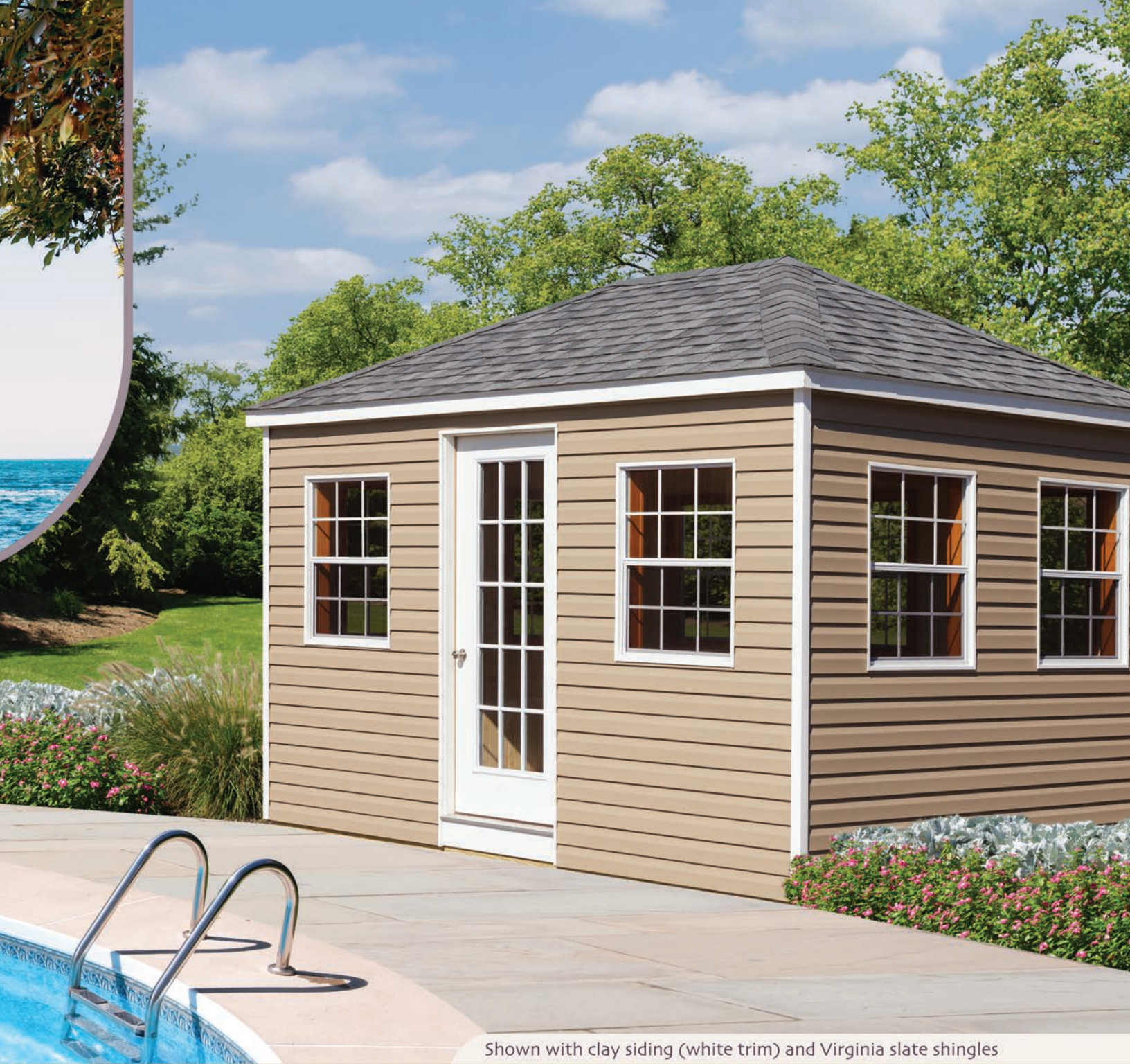
Shown with clay siding (white trim) and Virginia slate shingles