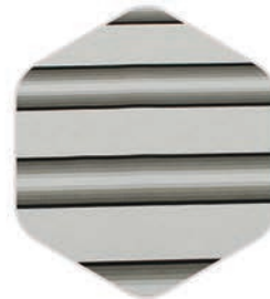
Grey Black White