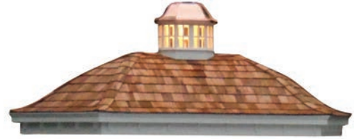
Cedar Shake Roof