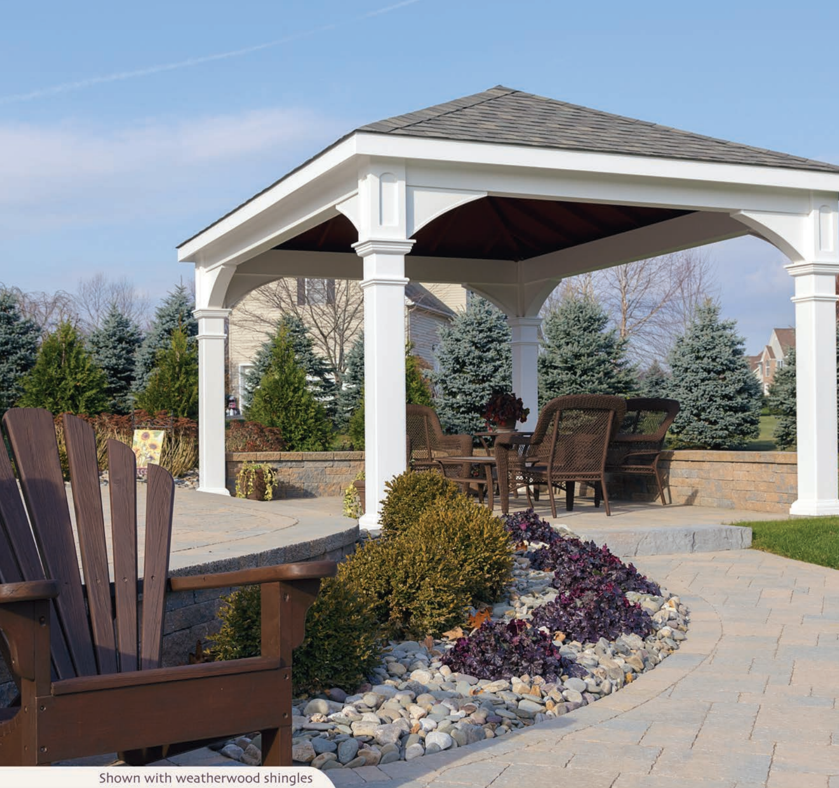
Shown with weatherwood shingles