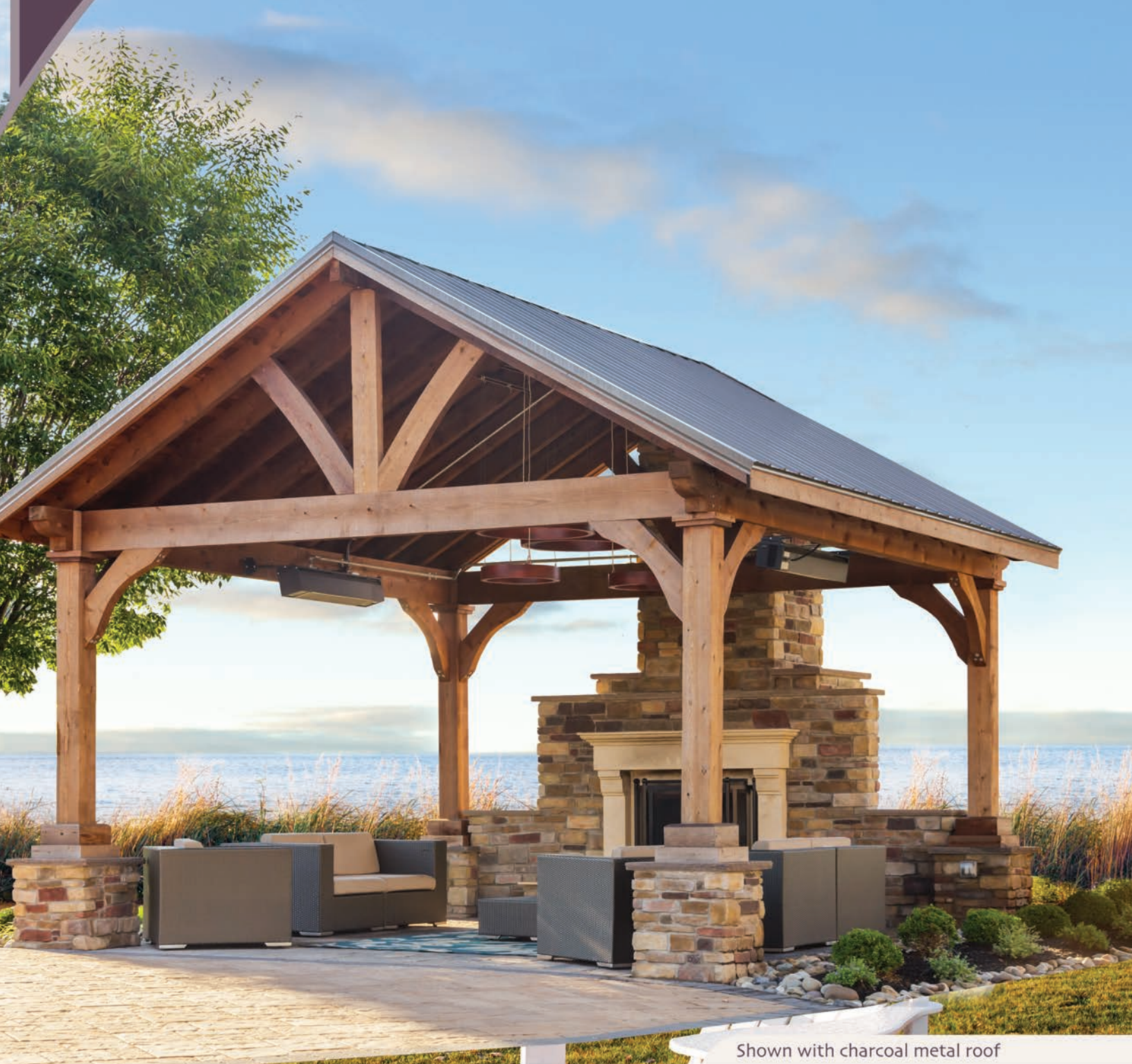
Shown with charcoal metal roof