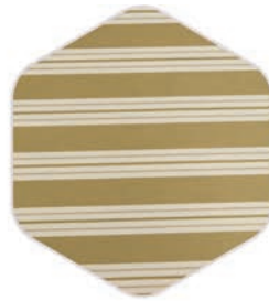
Heather Beige Classic