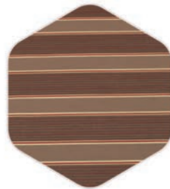
East Ridge Cocoa