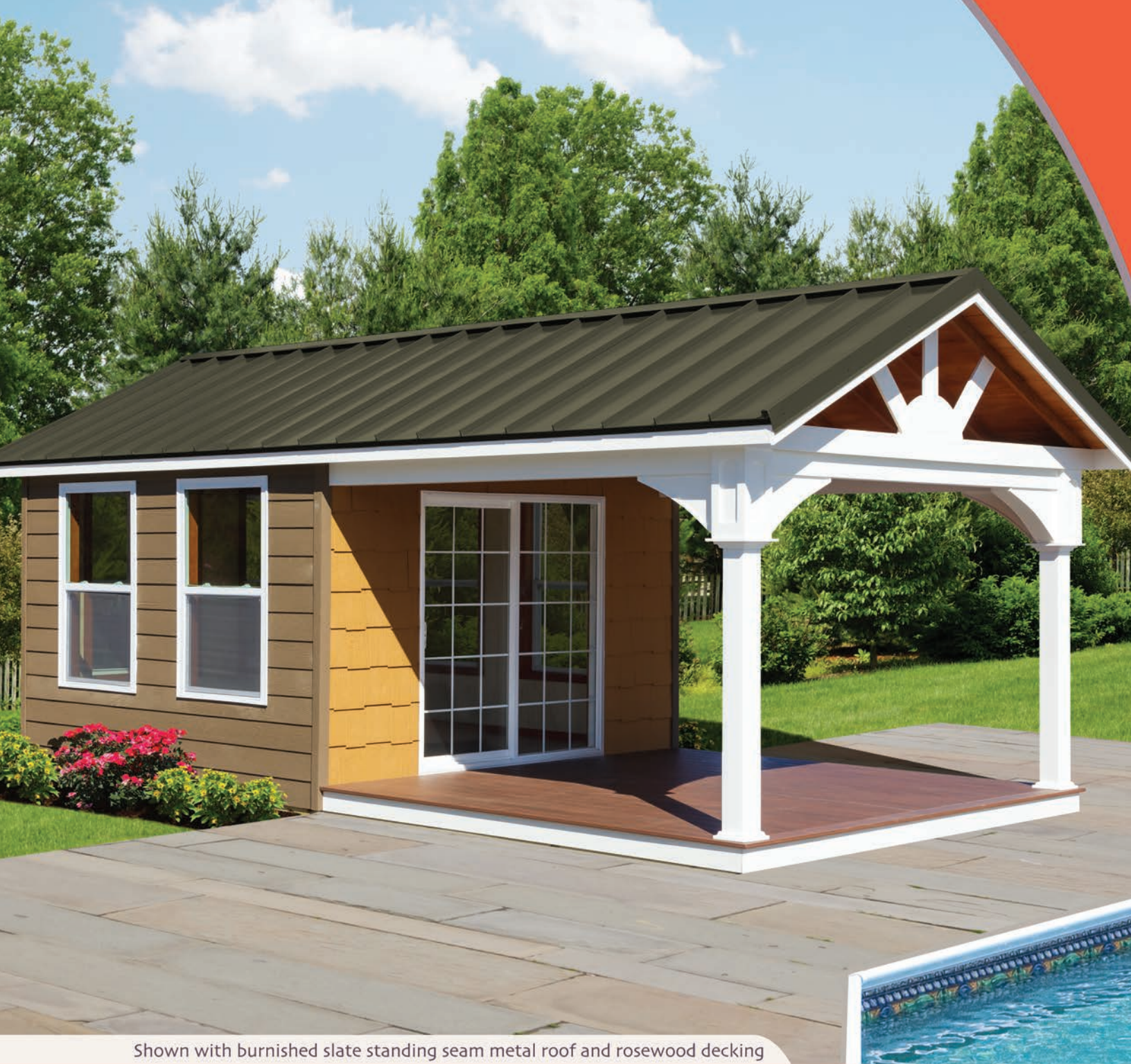
Shown with burnished slate standing seam metal roof and rosewood decking