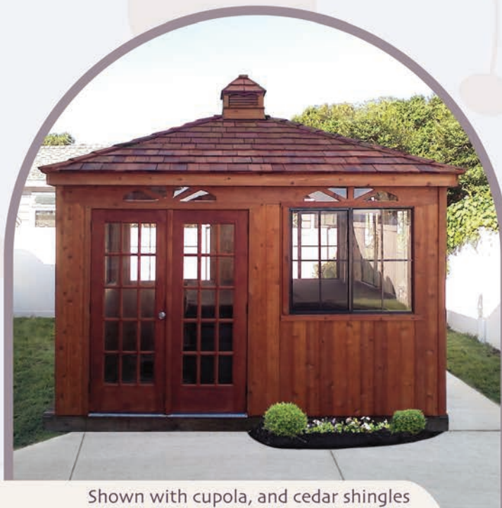
Shown with cupola, and cedar shingles

This beachside cabana is ready to join your spa-like retreat. A warm choice of color paints a picture of sand against the sunny skies above. It provides privacy for pool goers looking to sneak away into solace, or a pragmatic solution to hiding all the accessories that the kids or grandkids acquire for their many pool parties. You can't go wrong with this timeless classic and will be thrilled by the function it provides to all.