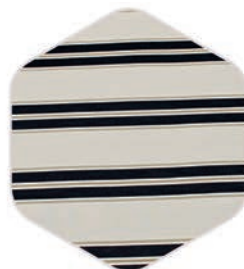
Navy Taupe Fancy