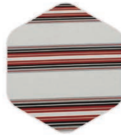
Burgundy Black White