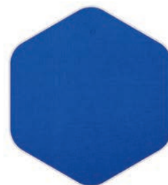
Royal Blue Tweed